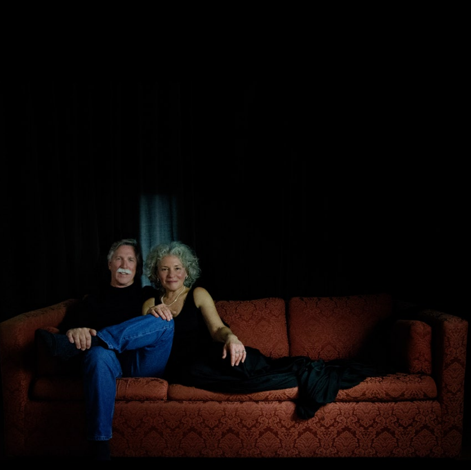
With whom do you want to be seen?