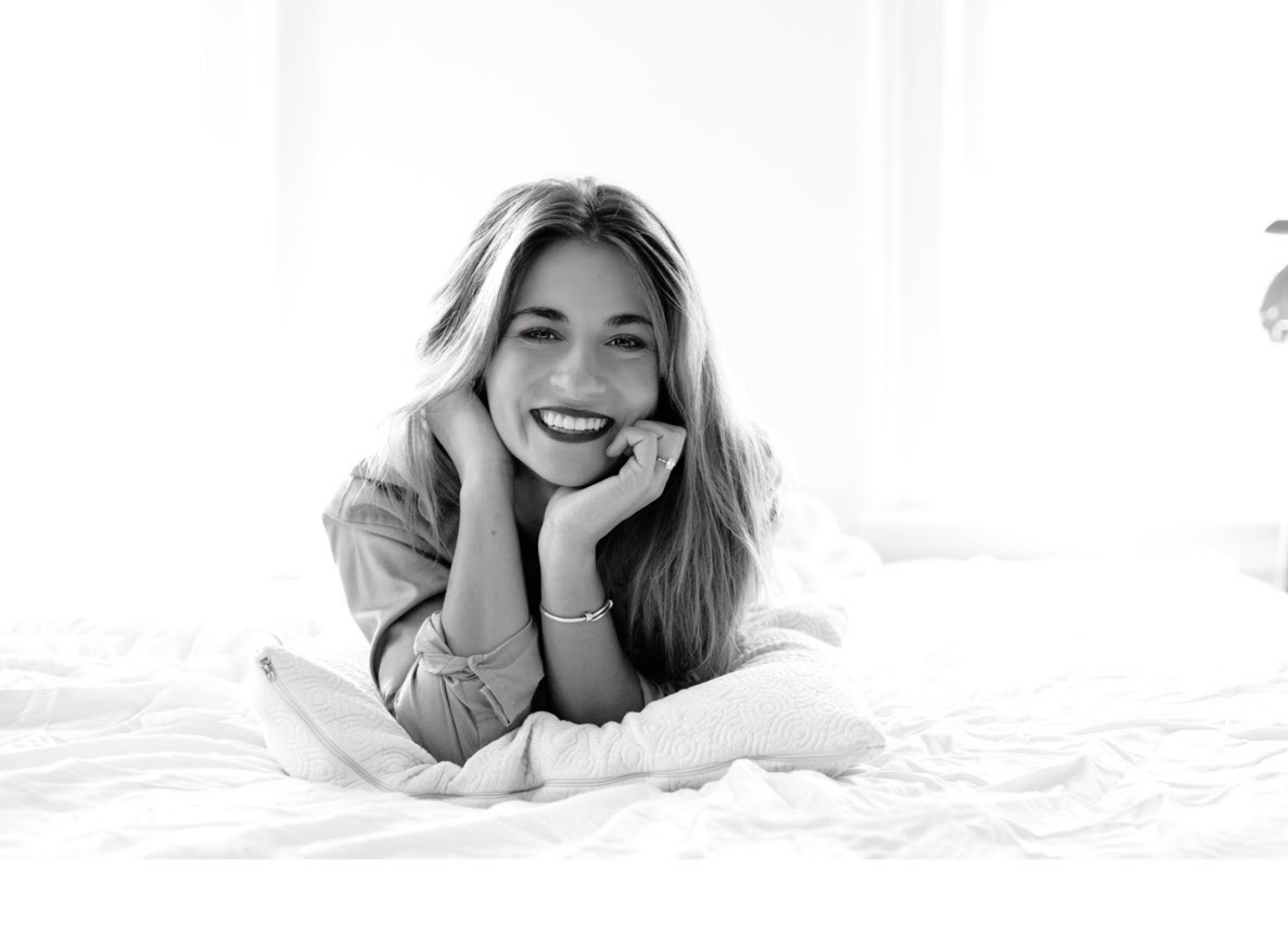
Wherever it is, with whomever you choose, however you'd like...