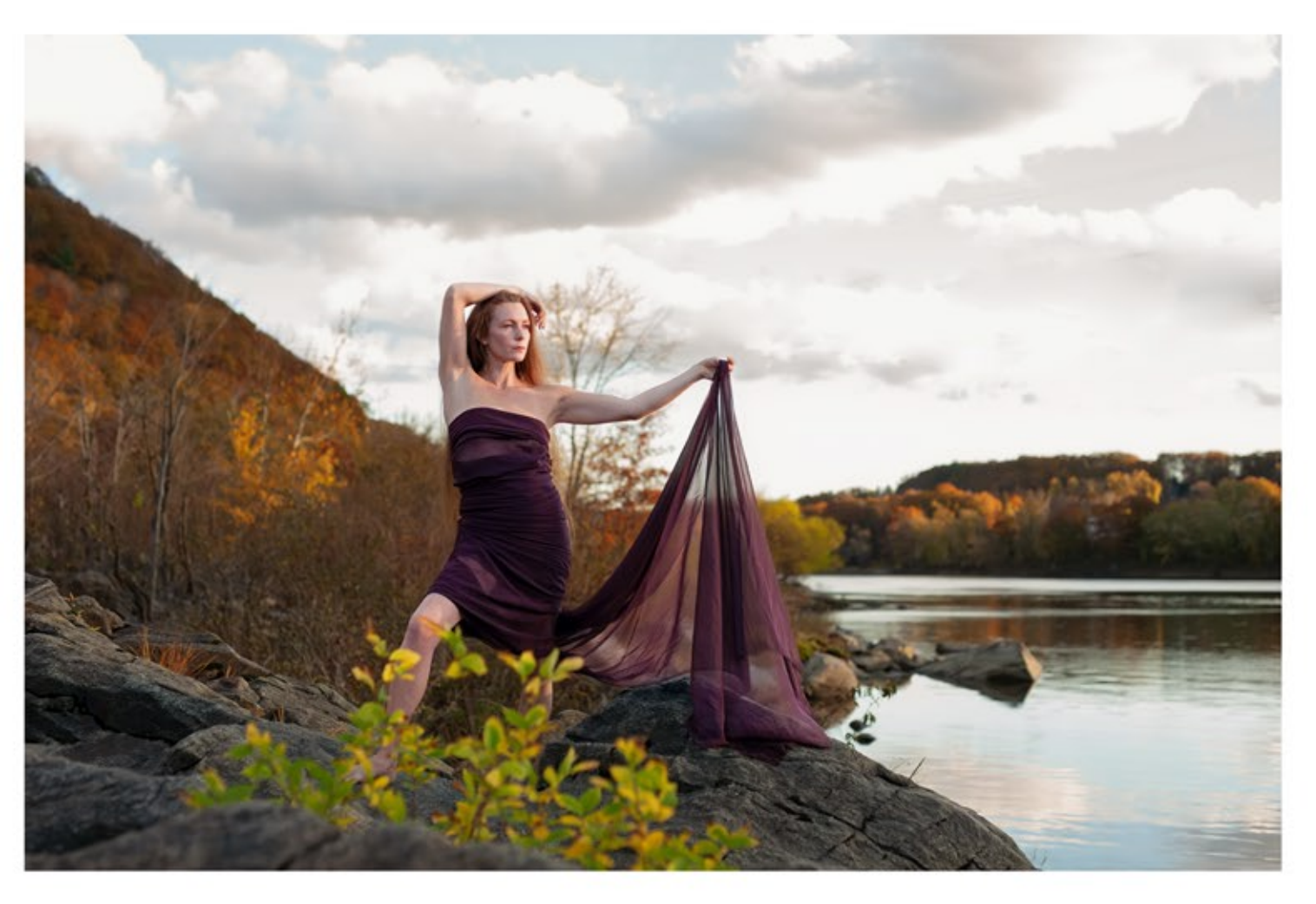
Where do you want to be seen?