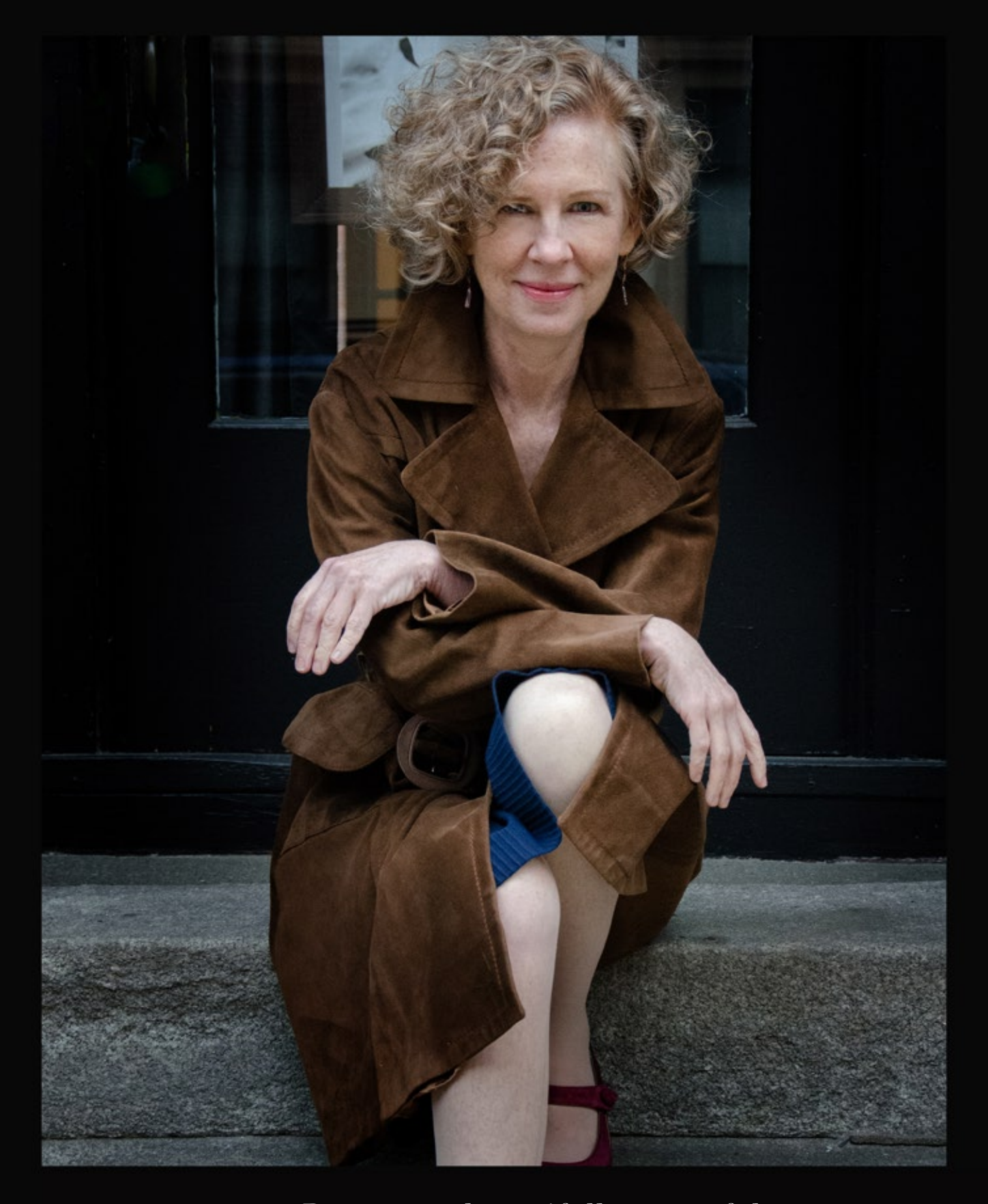
Be seen as beautifully powerful